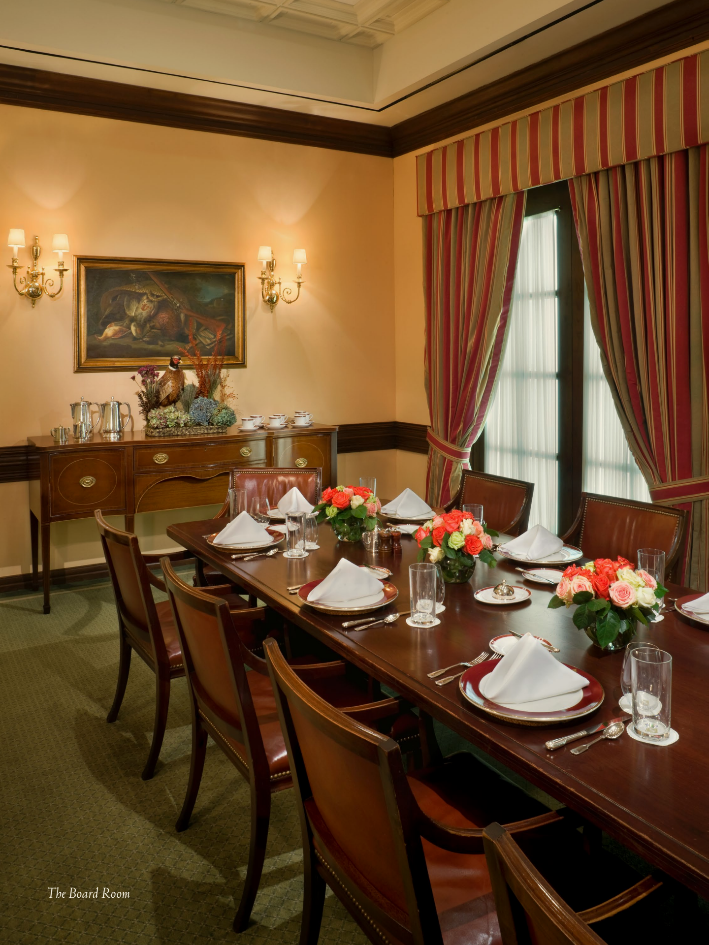
The Board Room