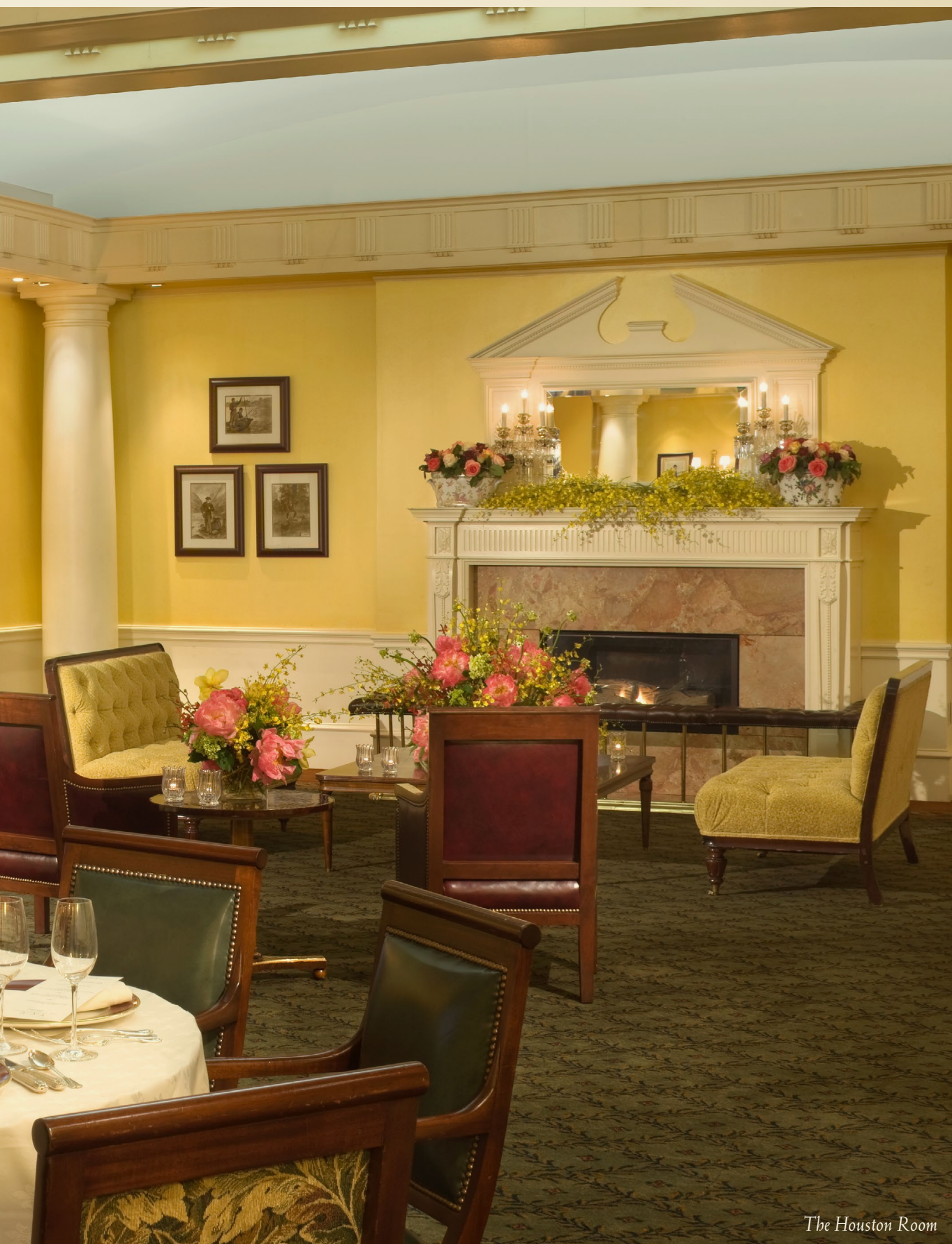
The Houston Room