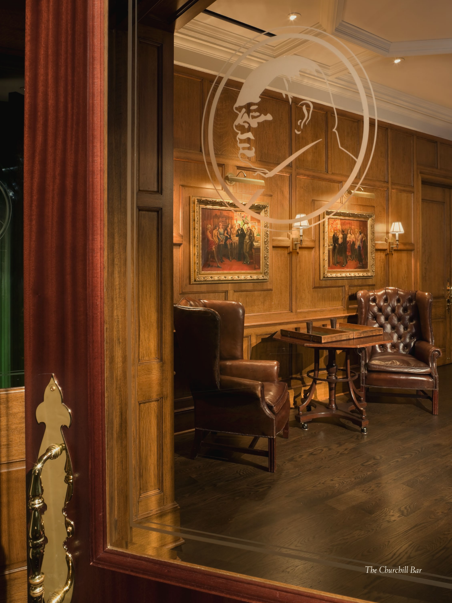
The Churchill Bar