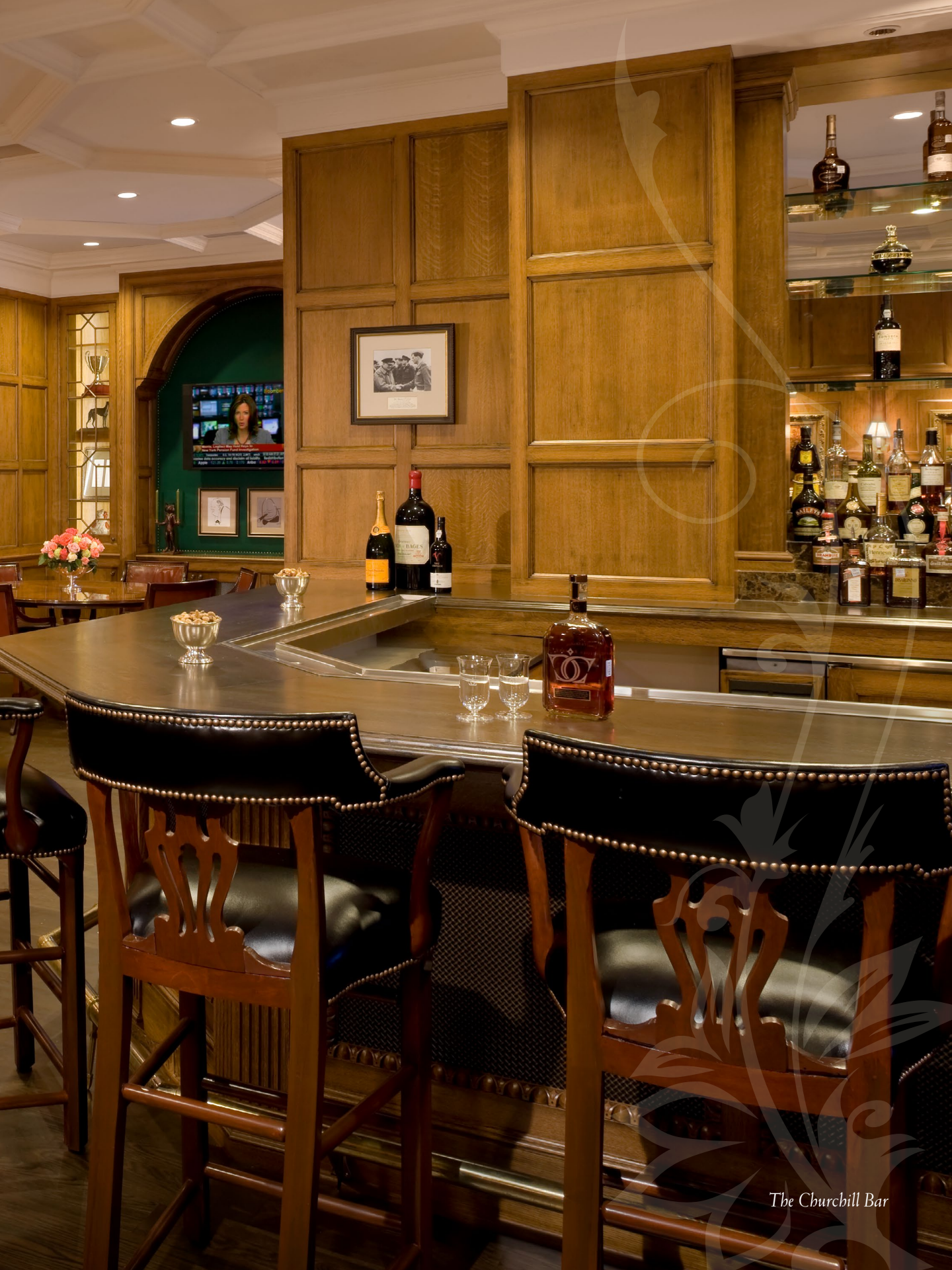
The Churchill Bar