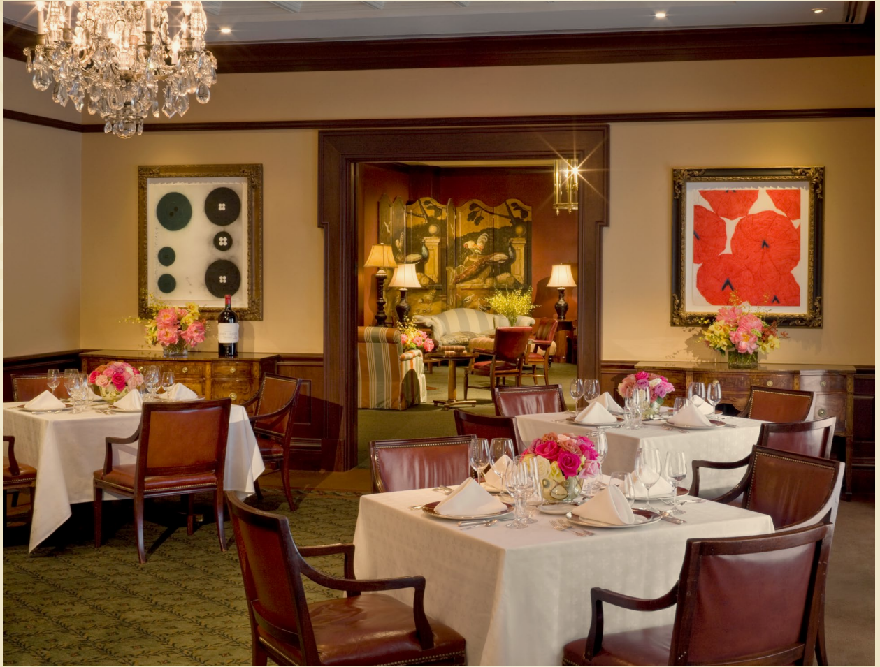
The Coronado Room