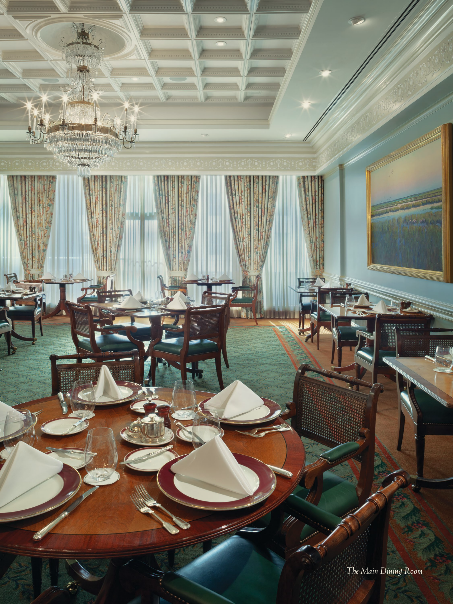
The Main Dining Room